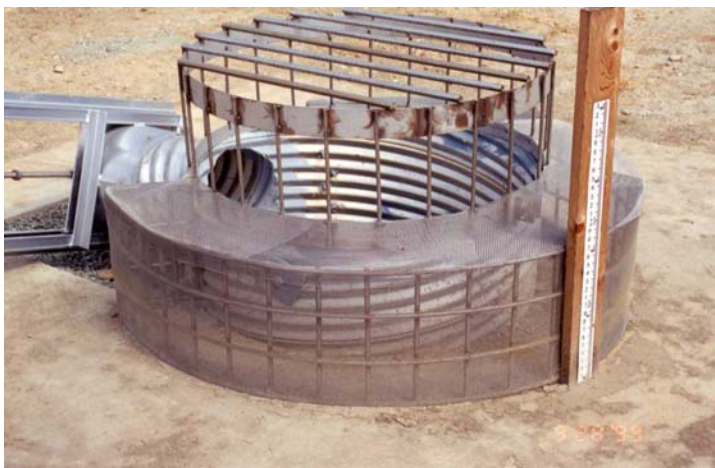
Figure 1 Example of Extended Detention Outlet Structure

The facility's drawdown time should be regulated by an orifice or weir. In general, the outflow structure should have a trash rack or other acceptable means of preventing clogging at the entrance to the outflow pipes. The outlet design implemented by Caltrans in the facilities constructed in San Diego County used an outlet riser with orifices