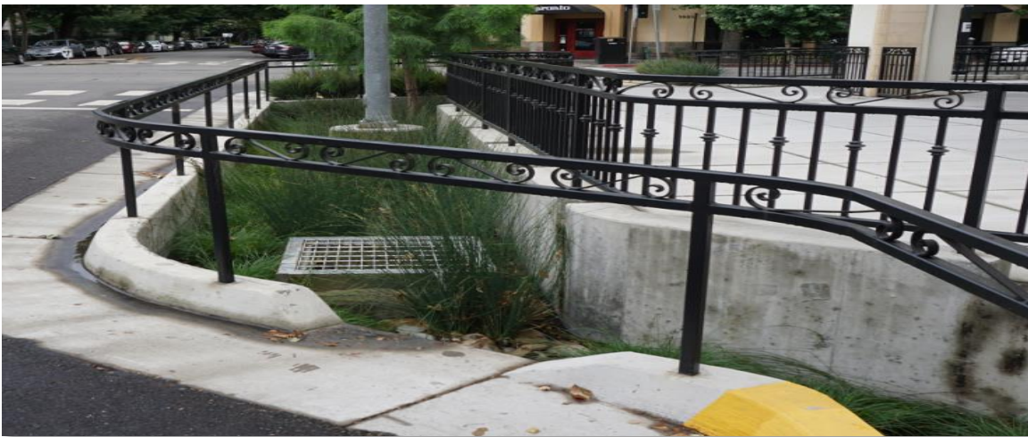
Figure A: Photograph of an Urban Infiltration Trench

This information sheet generically describes the categorically certified Infiltration Trench or Basin Multi-Benefit Full Capture Systems and the associated specific design requirements.