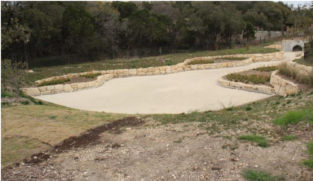
Figure A: Photograph of a Media Filter, County of San Diego

This information sheet generically describes the categorically certified Media Filter Multi-Benefit Full Capture Systems and the associated specific design requirements.