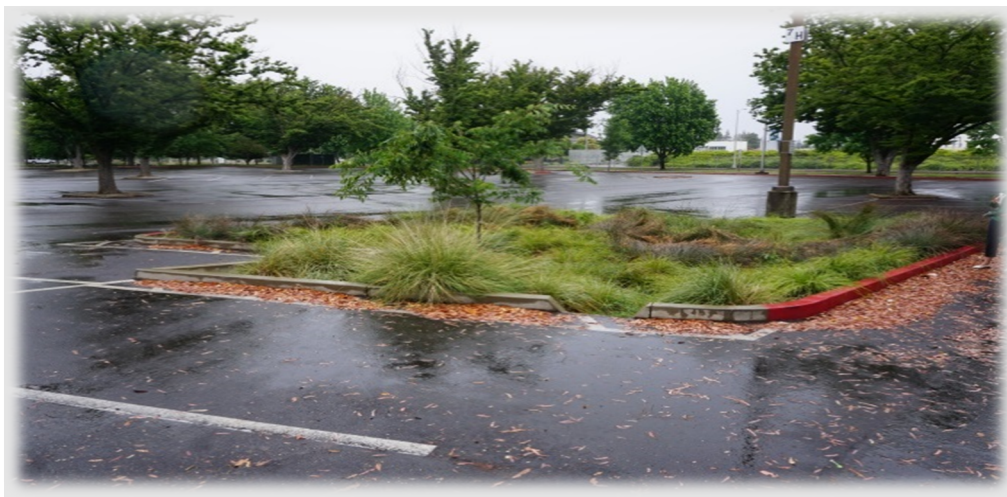
Figure A: Photograph of a Bioretention System at Sacramento State University

This information sheet generically describes the categorically certified Bioretention Multi-Benefit Full Capture Systems and the associated specific design requirements.